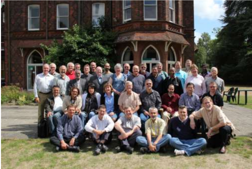
Participants at the Global Mission Roundtable – All Nations, UK.